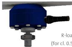
R-load cell (for cl. 0.5 ISO 7500)