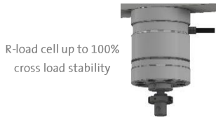
R-load cell up to 100% cross load stability