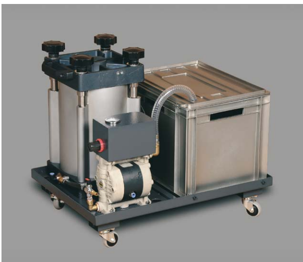
Enviro recirculating filtering unit