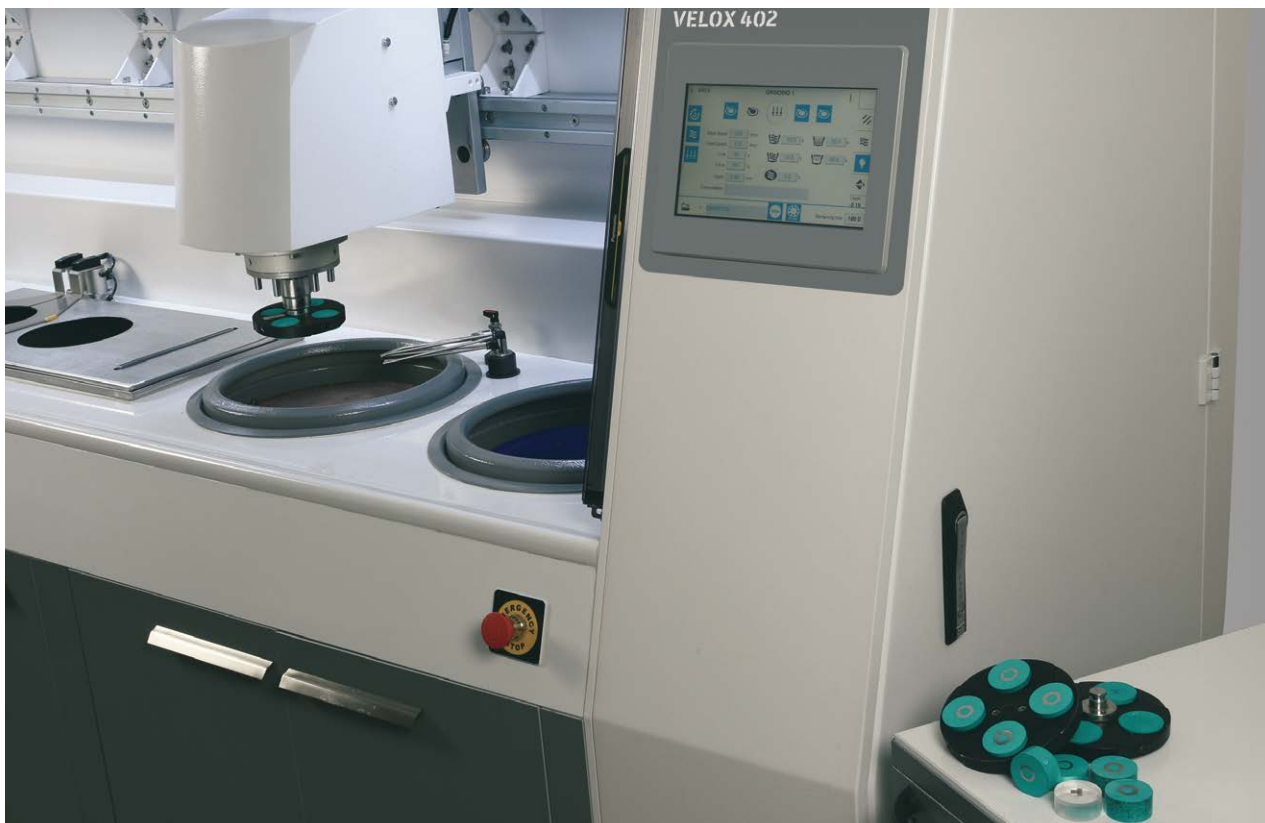
Fully Automatic Programmable Grinding/Polishing System

VELOX 402 has the highest safety standards. The equipment is provided with safety light curtain allowing easier process monitoring and easier access to the preparation area. It prevents access to moving or rotating parts during operation. When operator fingers, hand and ankles approaches to the operation area, the equipment stops immediately. A stack light is located on the top of the equipment to provide visual and audible indication of machine status.