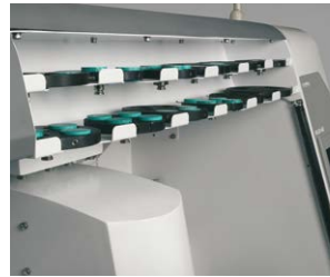
Storage For Specimen Holders

Two Built-in Peristaltic Dispensers are located in the cabinet and guarantees exactly the same dosing every time. Diamond suspensions / lubricants and aluminum oxide suspensions can be fed. Dosing parameters like; frequency, fluid selection etc. are controlled through the programme memory of the VELOX 402. Each dispenser has 3 peristaltic pumps for diamond suspensions / lubricant and 1 pump for aluminum oxide suspension. The liquid is dosed exactly to where the operator wants it on the polishing cloth. No vaporization or spray mist occurs.