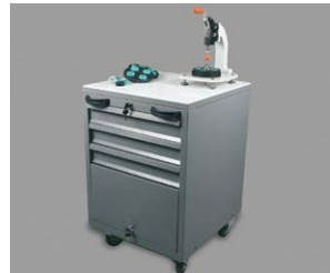
Stand For Levomat