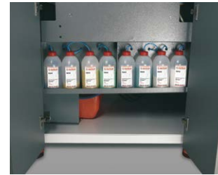
Automatic Fluid Dispenser