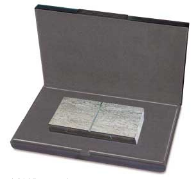
ASME test piece Ref.No. 135 520

Due to its separation into two halves a direct comparison of two penetrants applied on one half each is possible.