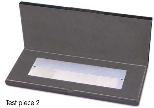
according to EN ISO 3452-3 Ref.No. 135 510