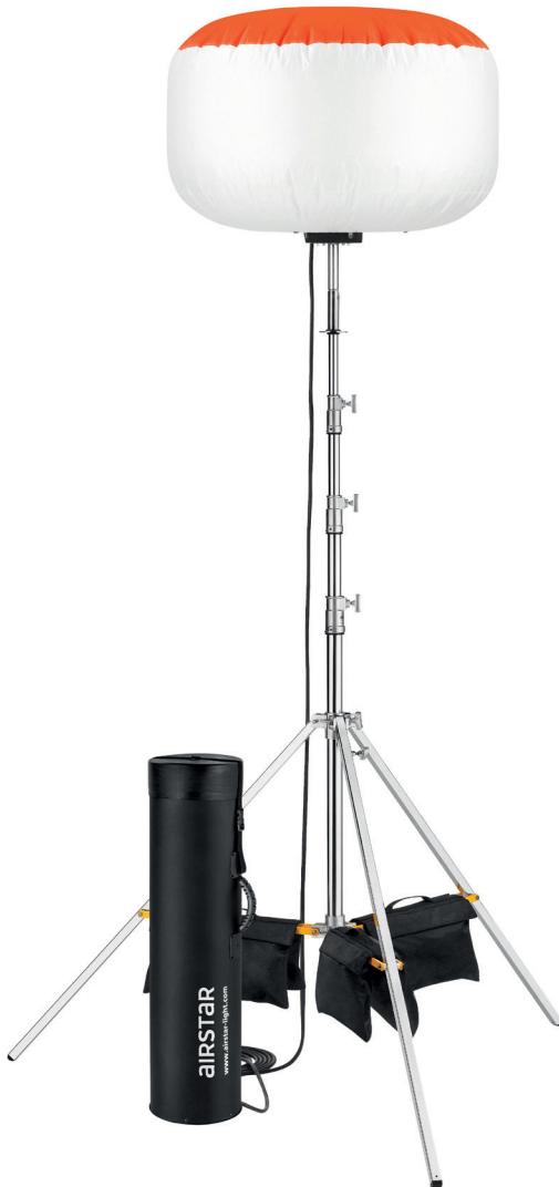
Sirocco by Airstar